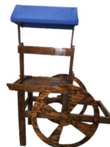
A breakfast cart made by Edenton Chowan high school students