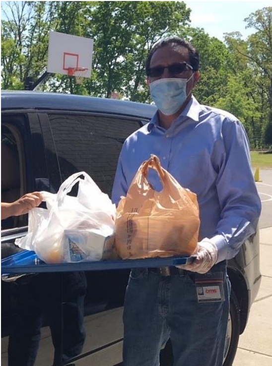
CMS staff delivering meals to families at curbside locations

3. Do you have existing relationships with the families and within the communities you may not be reaching? If not, how can you authentically build new relationships? New community partnerships can be a great way to strengthen your work and improve your program. Relationships could be with community organizations, community leaders, or individual people. When reaching out, consider the work they are already doing, the ask that you are making, and the timing of your outreach. Some relationships may require ongoing communication, rather than just when you need something.