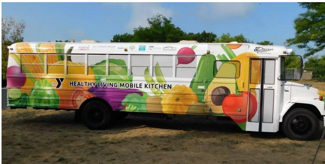
The "Travelin' Table" mobile meals bus

In conversations with your community, families may identify additional opportunities for support, beyond food for kids. Who can you partner with in your community to reach families with additional resources? How might you work with your local SNAP and WIC offices to help families apply for additional food assistance? Can you work with your local food bank to promote its services or integrate them into yours? If families are looking for support with housing, healthcare, or employment assistance, who in your community might be able to help, and how might you make them part of the conversation? Can you co-locate these services with your meal service for easier access?